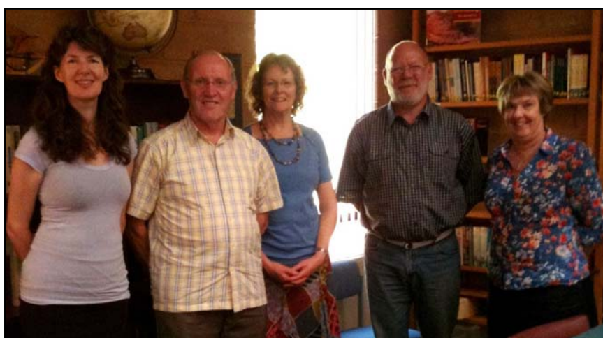
Your CSD Reference Group: