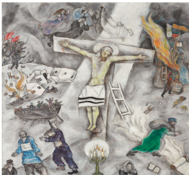
Crucifixion in White, by Marc Chagall

One highlight of the weekend was the prayerful reflection on the painting of Marc Chagall's, Crucifixion in White painted before the Second World War in 1938. This provided a powerful context for each of us to draw a picture of how we see ourselves in our ministry of spiritual direction. Being present to our God, listening to his promptings and responding in colour created some beautiful and moving images of the rich blessings of this life-giving ministry.